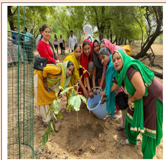
Local women were encouraged to participate in tree plantation