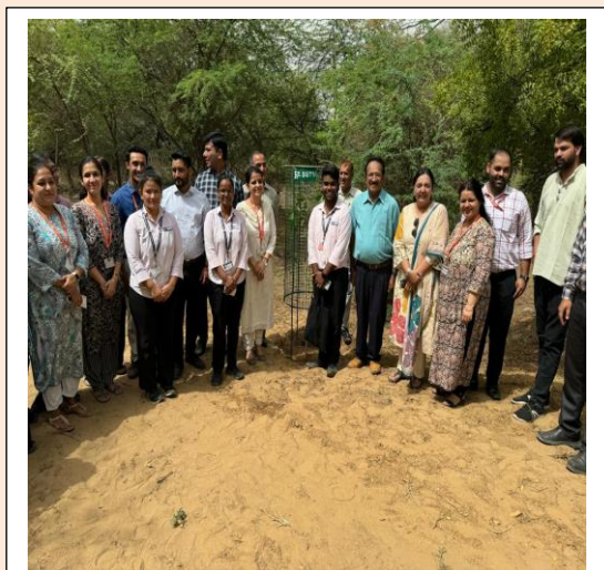
After tree plantation session