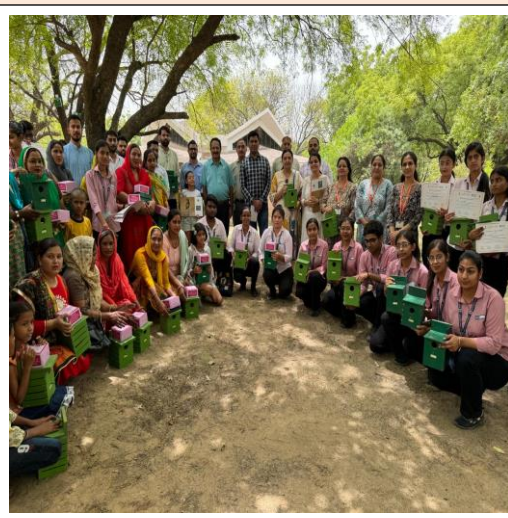
Students of Nursing and local people were gifted wooden bird nest